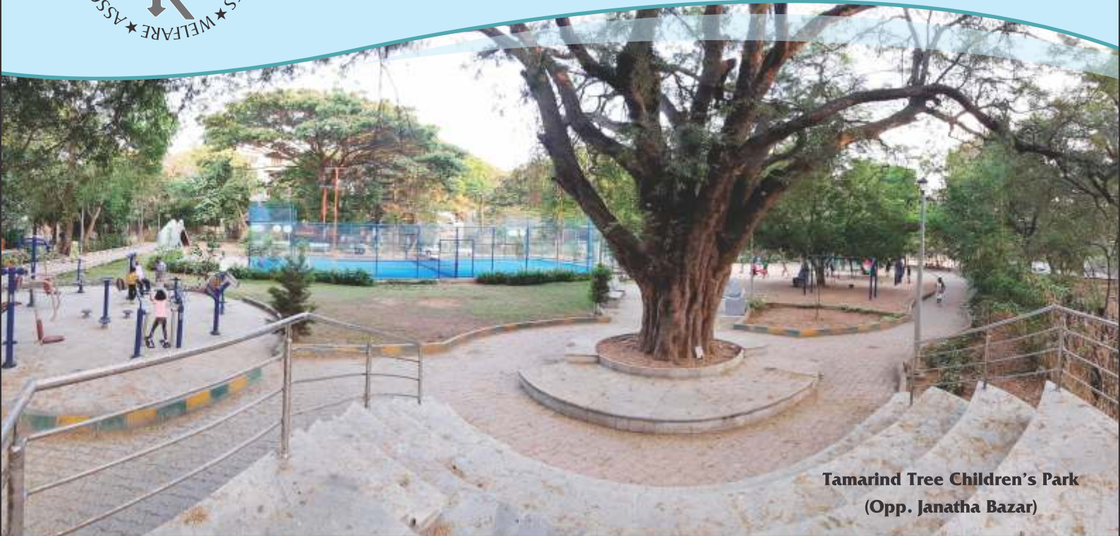
Tamarind Tree Children's Park (Opp. Janatha Bazar)